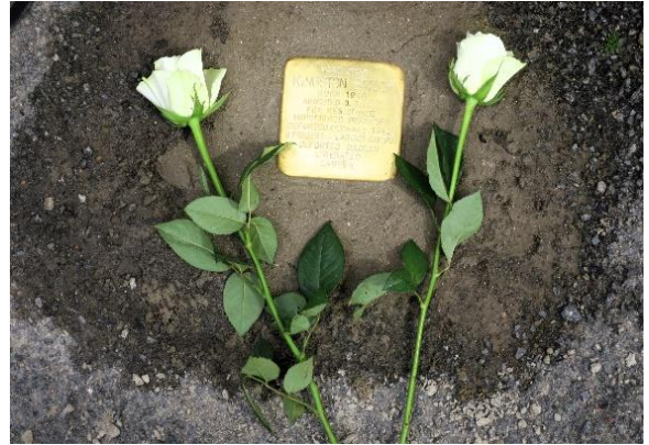
The Finished stone with Rose

More information on the Stolpersteine project can be found on this link https://www.stolpersteine.eu/en/home To view, copy and paste this link into your browser.